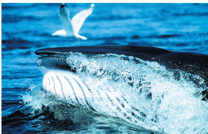
Thirteen species of whales are found in the region.