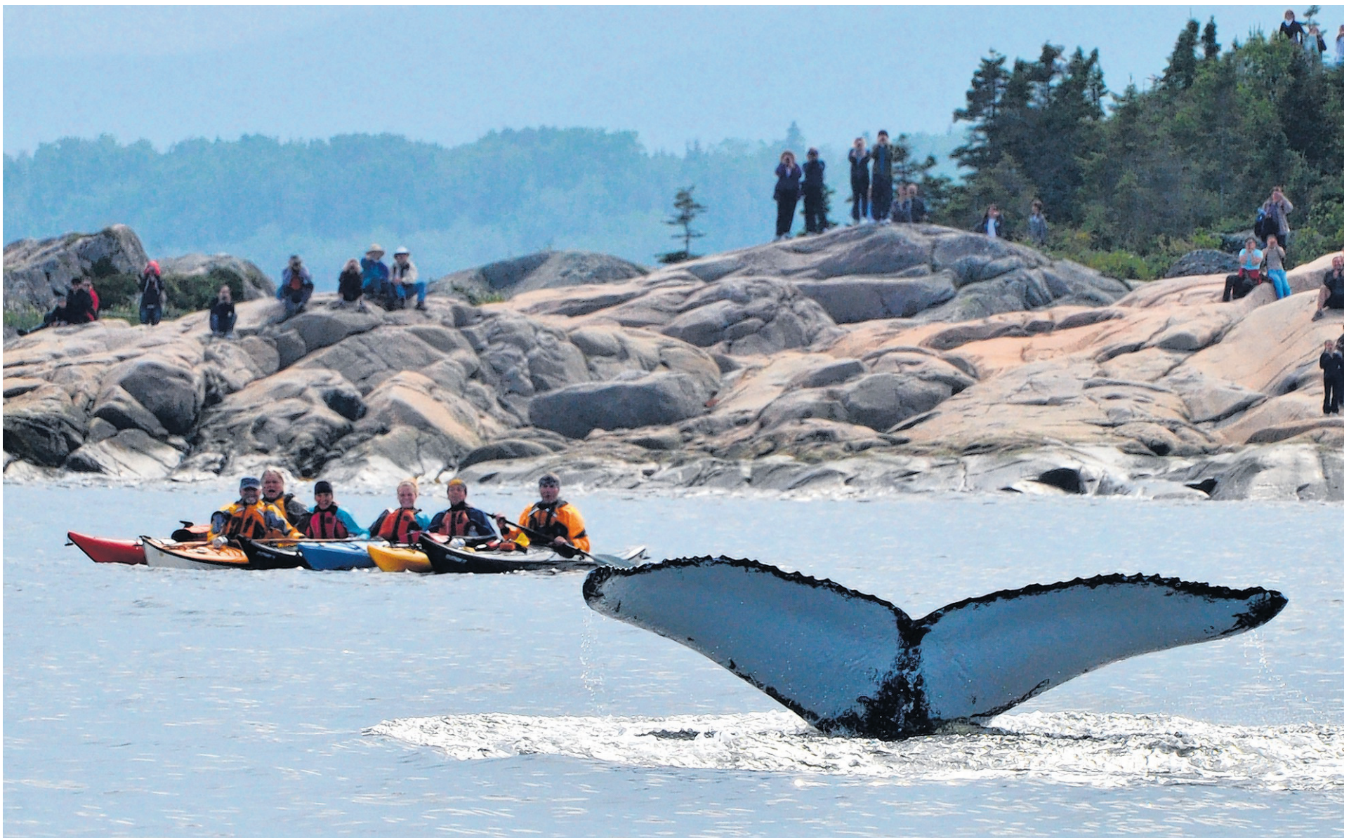
Minke whales can be seen by Zodiac boat, kayak or even from the shore in the Tadoussac area.