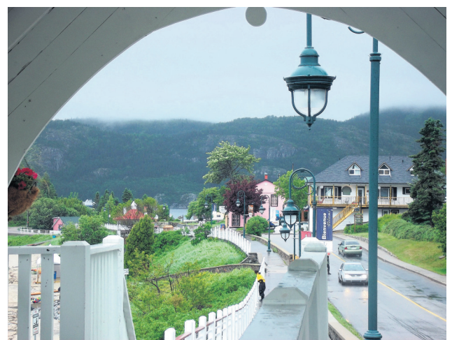
The town of Tadoussac has a quaint French feel, with neat wooden homes and no chain stores.

Suddenly, our captain called out to us in heavily accented English: "Look, 2 o'clock, a minke whale!" Sure enough, with flashes of pink and white belly, a glimpse of a huge eye, and whipping wild splashes of water pouring from its flanks, a minke whale was right in front of us. It was