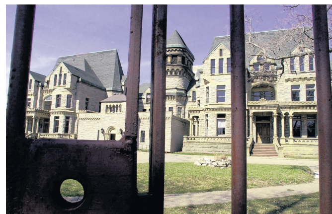
The Ohio State Reformatory in Mansfield served as backdrop to the prison-break film The Shawshank Redemption.